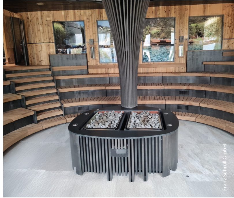
Franz Schroll GmbH