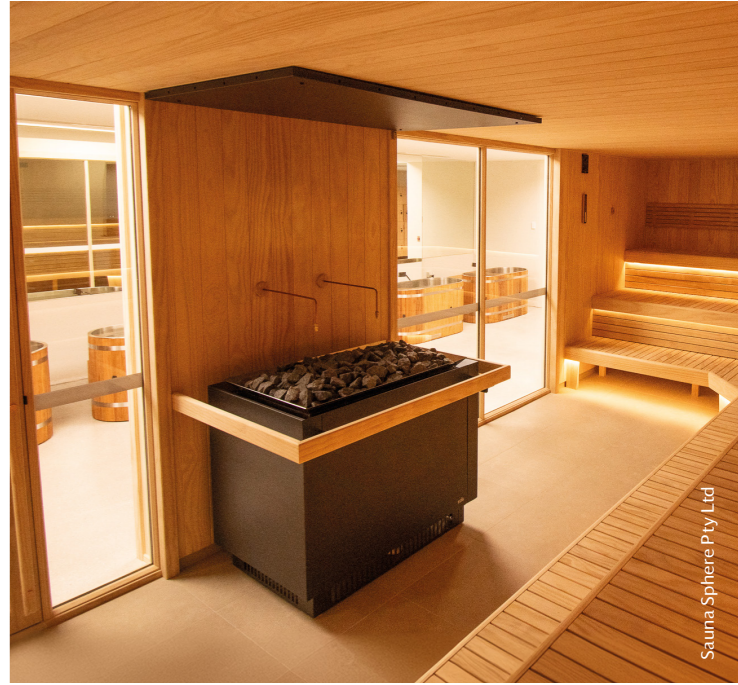
Sauna Sphere Pty Ltd