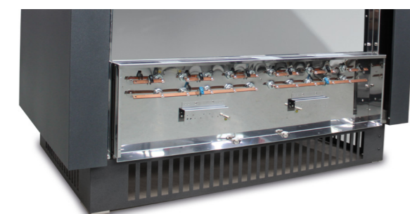
Terminal box of EOS Mega HD