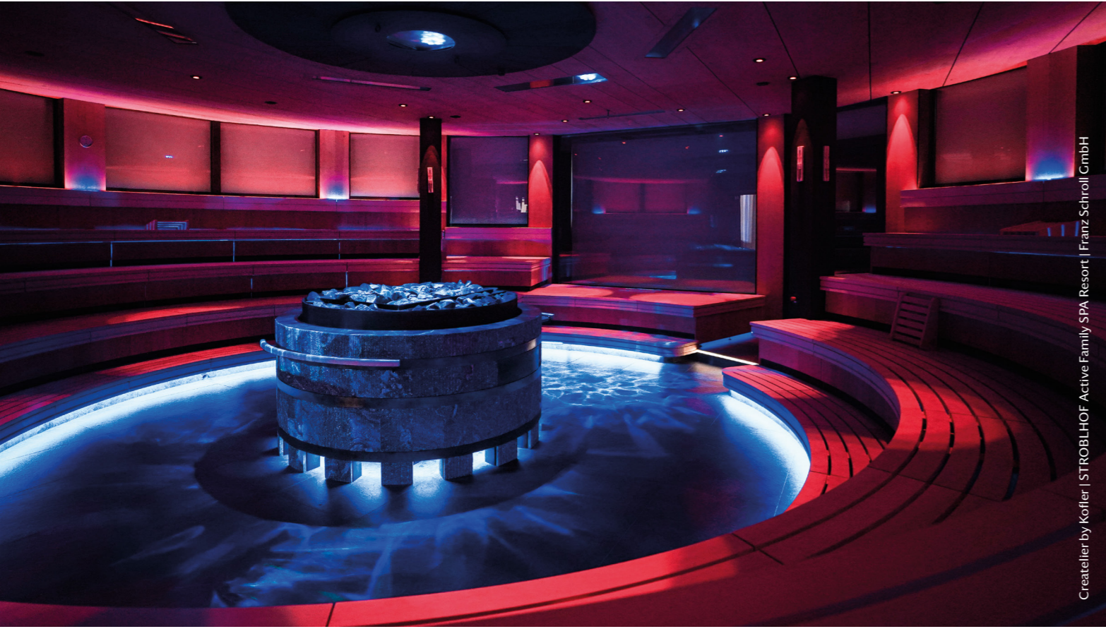
Creator by Kofler | STROBLHOF Active Family SPA Resort | Franz Schroll GmbH