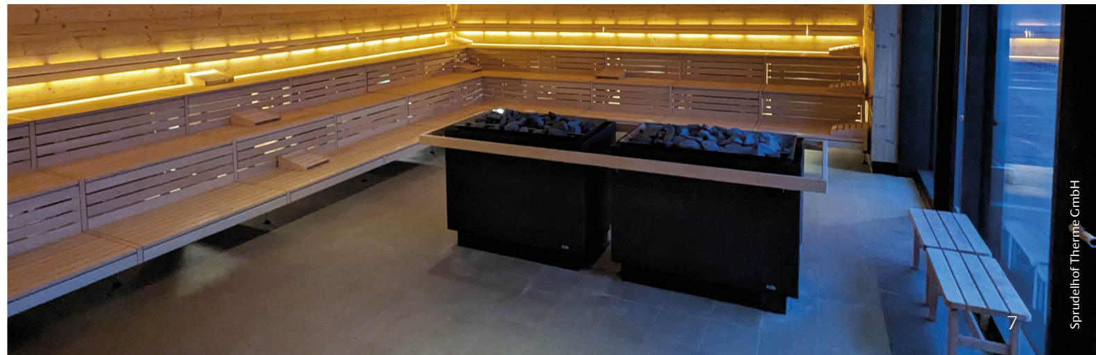
Sprudelhof Therme GmbH