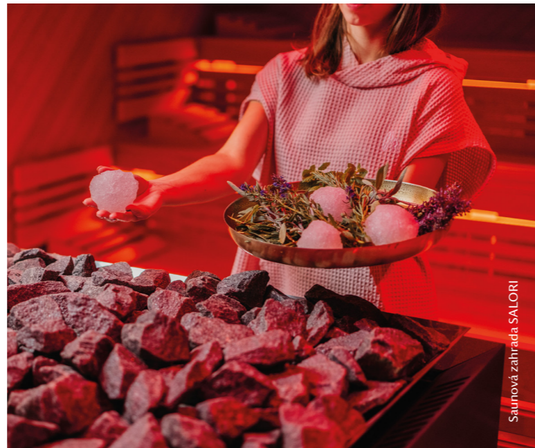
Saunová zahrada SALORI